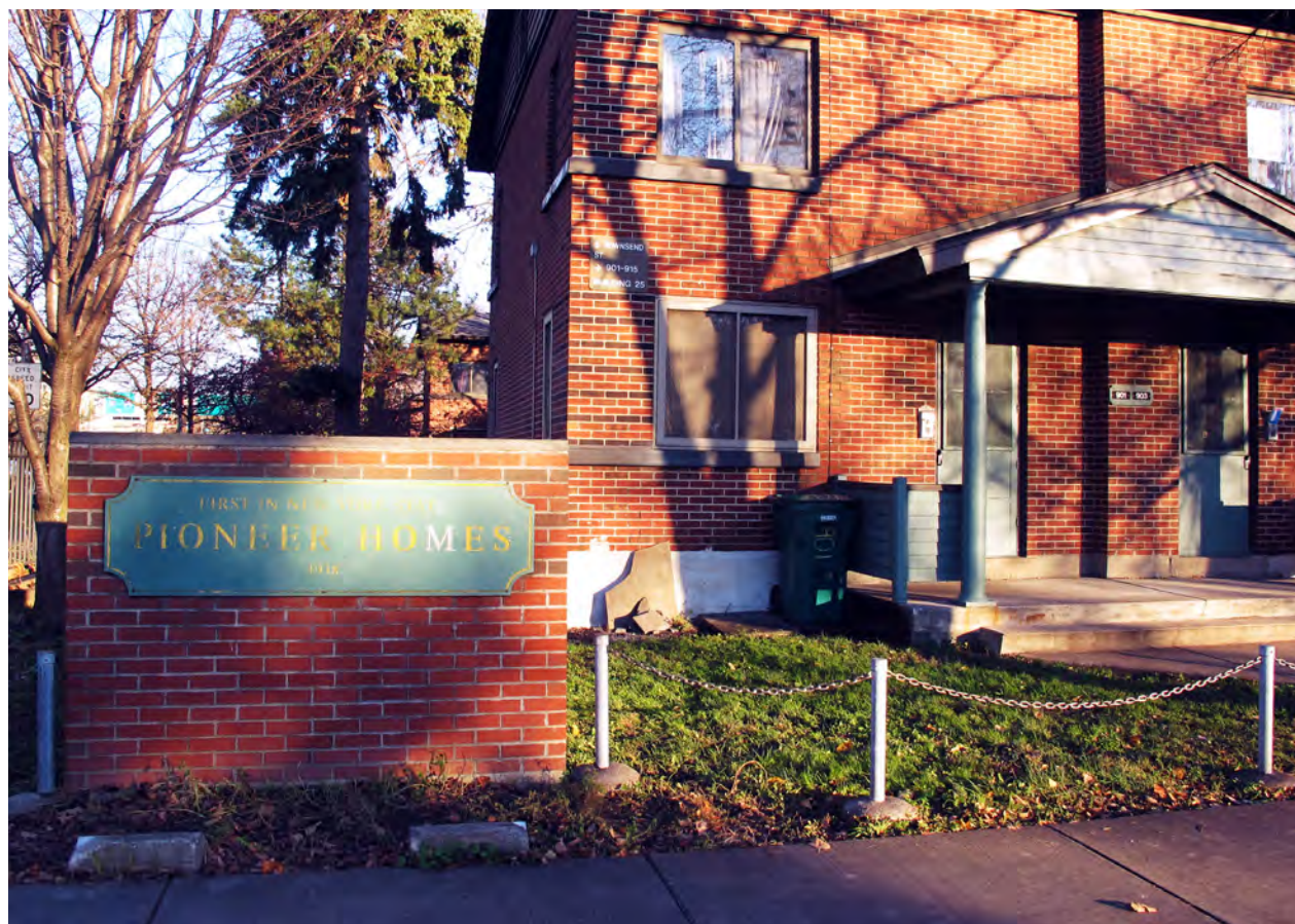
> Pioneer Homes, located at 116 Radisson Court, is one of the nine asset management programs run through Syracuse Housing Authority.

Syracuse Housing Authority celebrates 75th anniversary