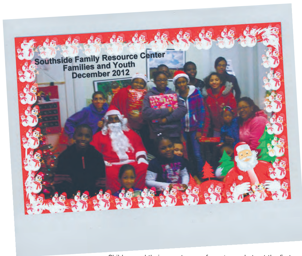
> Children and their parents pose for a group photo at the first Christmas party at the center in 2012.

The South Side welcomes the Christmas season with a celebration