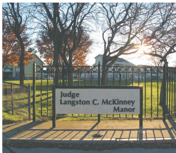
> Half of the residents in Syracuse Housing Authority sites are elderly or disabled, while the other half are families.