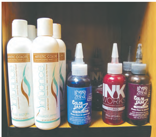
> Hair products at Mo's Touch.