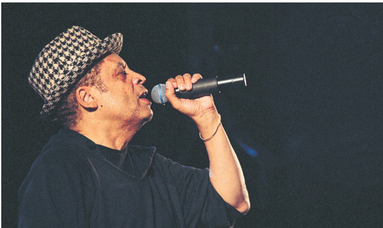
> Garland Jeffreys, a veteran of rock 'n' roll, blues, soul and reggae, returns to Syracuse this month to perform. He first came to Syracuse in 1965 to study fine arts at Syracuse University.

'The King of In Between' brings his eclectic mix to Syracuse