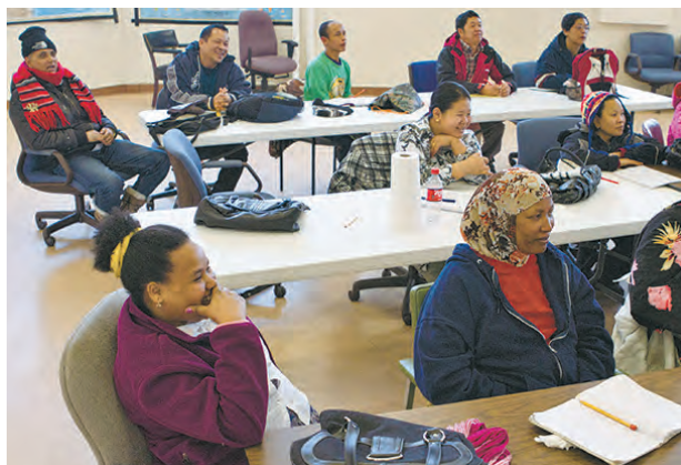
> Students from Somalia, Nepal, Burma and Eritrea learn English at the Somali Bantu Community Organization.