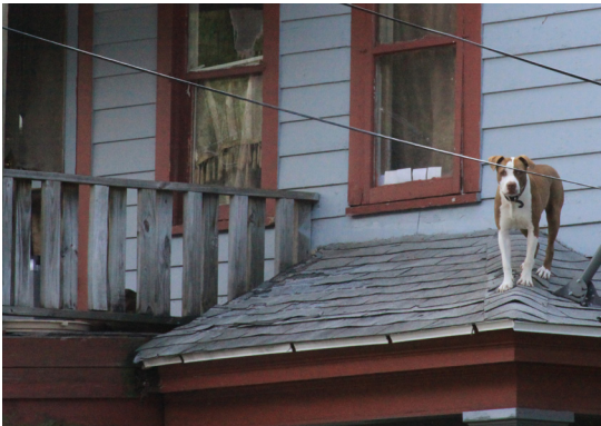
| BRIAN BRISTER